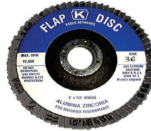
Flap disc with 7/8" arbor hole