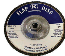
Flap disc with 5/8-11 threaded arbor